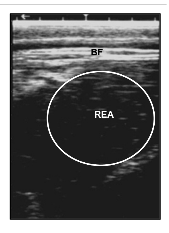
Figure 2. Transverse ultrasound image of backfat (BF) and ribeye area (REA) between the 12<sup>th</sup> to 13<sup>th</sup> rib in water buffalo.

Figure 1. Transverse ultrasound image of backfat (BF) and ribeye area (REA) between the 12<sup>th</sup> to 13<sup>th</sup> rib in cattle.